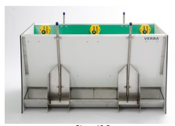
Bigro 48 D