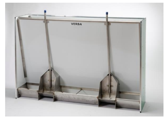
Bigro 24 100